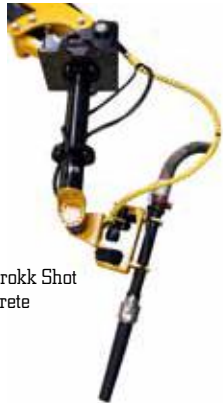
Brokk Shot Crete