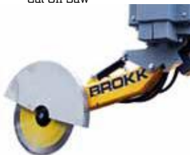
Cut Off Saw