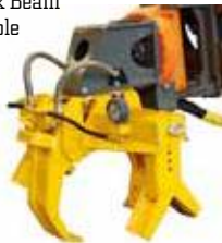
Brokk Beam Grapple